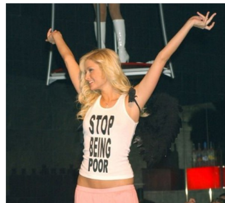
Meme inspired by UEL UCU's twitter account @EastLondonUCU