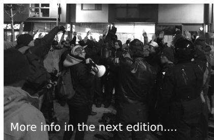
More info in the next edition....